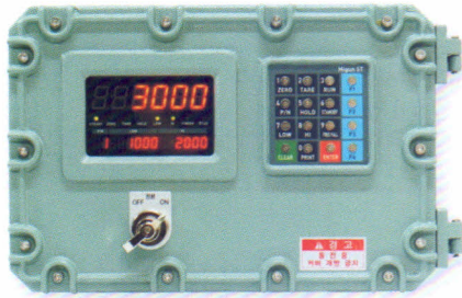
EXP-3000 (Multi-Control type)